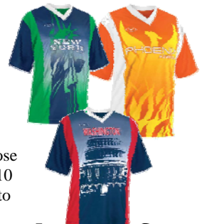
Jerseys for CISC Teams.

Questions: Call the sports center at 410-857-5098 or 410-840-9361.