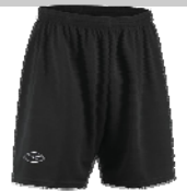
Shorts Available For $12 YXS-AL